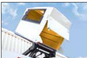
Lifeline® hopper system