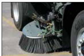
In-cab side broom tilt and extended reach