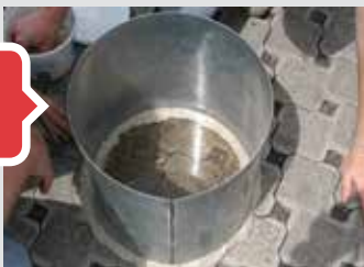
Adequate measurements of infiltration can be obtained with a single ring infiltrometer.